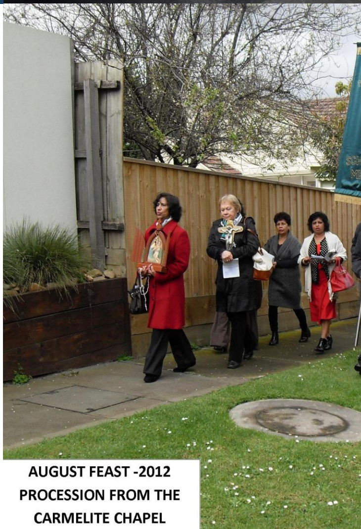
AUGUST FEAST -2012 PROCESSION FROM THE CARMELITE CHAPEL