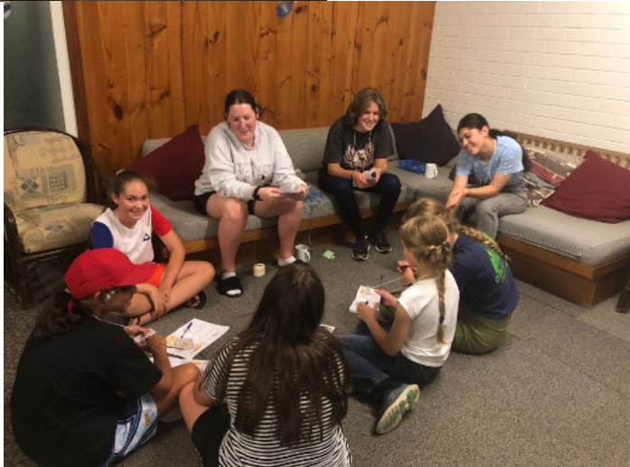
Camp Team Session 2023