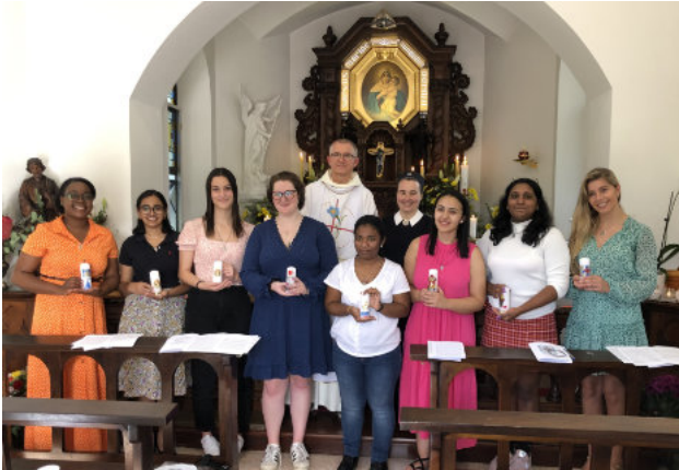
Senior Leaders Covenant of Love 2023

Schoenstatt Girls and Young Women (SGYW) were very blessed by the two Mission Weeks held in April 2022 and January 2023. The Mission Weeks consist in leadership training, the running of a girls' camp for younger girls and debriefing. Girls aged 14+ were invited to join and become young leaders. In 2022–23, 9 girls have taken up this invitation.