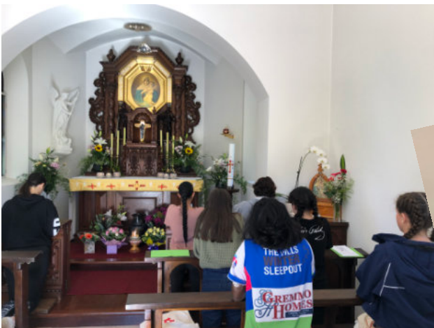
Mission Week April 2022

In April 2022, the theme was “Receive the Power from the Holy Spirit” and in January 2023 “Be Love, Live Truth, Reveal Mercy.” As 8 senior leaders made their covenant of love on Easter Monday, 18 April 2022, it was a wonderful blessing at both mission weeks that the leaders shared their enthusiasm about Our Lady and the Shrine with the junior leaders and young girls. 23 girls made their Marian Apostles consecration, a few of which have by now become junior leaders.