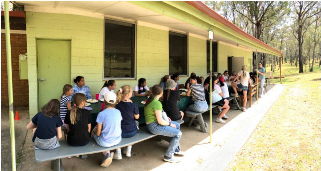
Camp January 2023