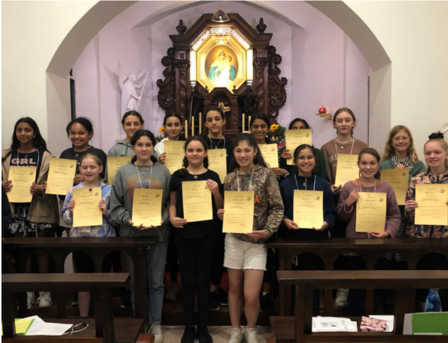
Marian Apostles Dedication 2023