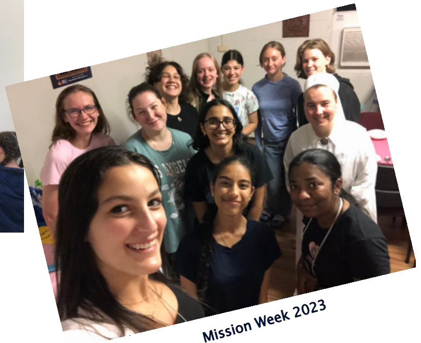
Mission Week 2023