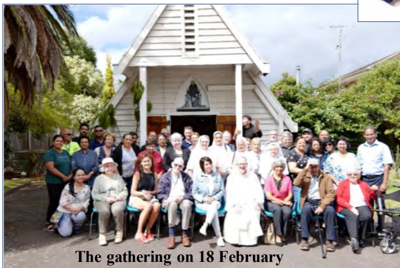
The gathering on 18 February