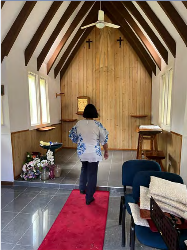
The Shrine stripped bare