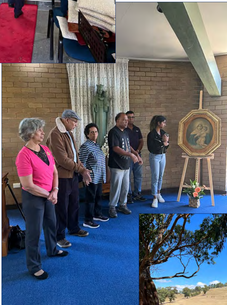
Lysterfield: A new home for the Blessed Mother