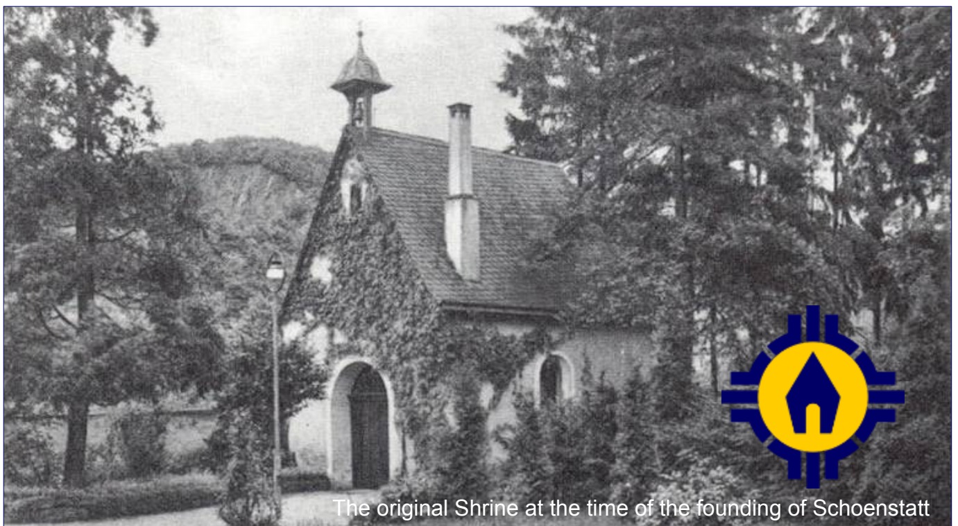
The original Shrine at the time of the founding of Schoenstatt