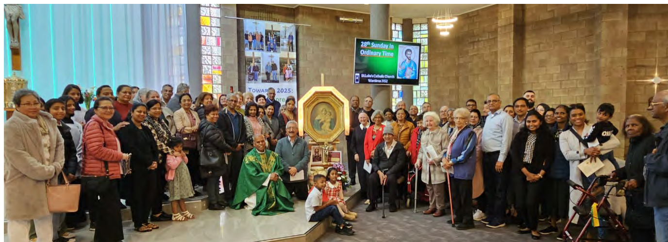
Melbourne Schoenstatt Family in parish church of St. Luke's Wantirna