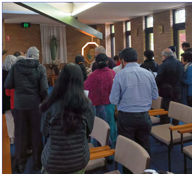
Thanksgiving in Lysterfield

In August as we celebrated our annual feast around 15 th August, Our Lady offered us a new possibility – a home in the parish of St. Luke's Wantirna, not too far from Lysterfield. After negotiations with the parish priest and parish council we were ready to bring the picture of grace of our MTA to its 'new home'.