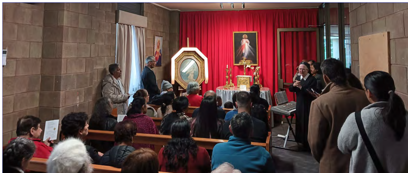
In the Divine Mercy Chapel

They do not grow tired of offering to God's Mother the sacrifices of their serious efforts in self-education which co-operation with grace demands of them in everyday life.... From today onward, the Mother of God also expects such earnest co-operation with grace from us.