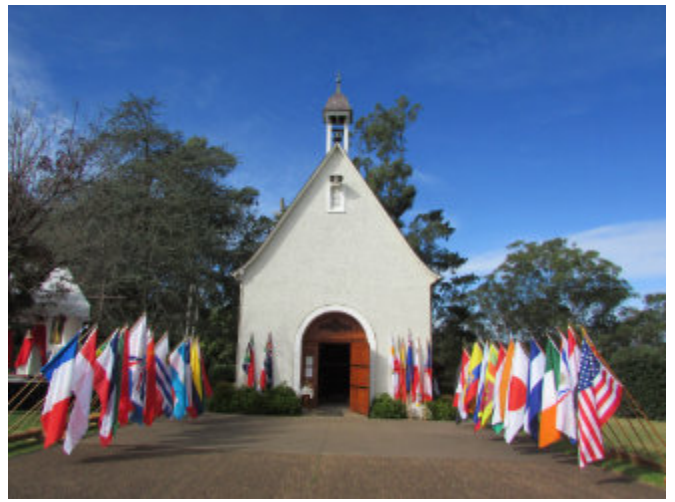
grounds of Mount Schoenstatt, Mulgoa.