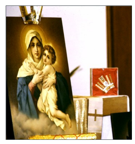
Crowning gifts at the altar

Apart from the symbols on the crown, each branch wanted to bring a CROWNING GIFT to their Queen, symbolising the ideal in the striving of the individual branch.