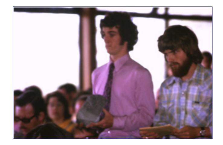
of security and strength, we give as our part in the coronation."

"As a Young Men's Group we pledge our loyalty in an attitude of self surrender to you, Mary, our Queen. Our offering gift, the rock, the symbol