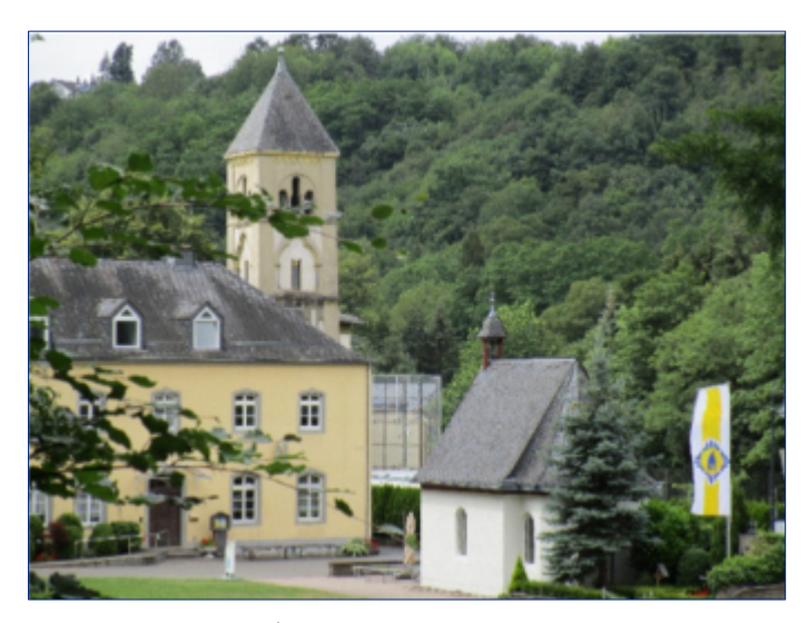
the expression of the Covenant of Love, the safeguard and the means for the Covenant of Love with our Lord and with the Triune God