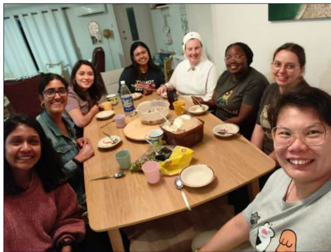
Bringing Hope, that Does not Disappoint

It was very special to find the jubilee year door open at St Mary's Cathedral and we were able to conclude our jubilee churches pilgrimages. Upon returning to our Schoenstatt Shrine, we offered sacrifices for the jubilee, as well as entrusting the intentions we collected during the retreat to our Blessed Mother.