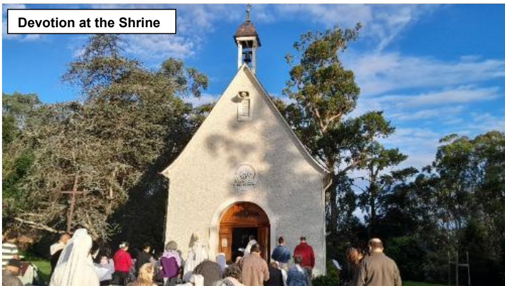
Devotion at the Shrine

These Jubilee Celebrations seemed the perfect time for our Schoenstatt family to give our Mother Thrice Admirable our Jubilee Gifts: the naming of the Shrine and a plaque to commemorate these occasions. These gifts are an expression of our gratitude for the many gifts and graces Our Lady has showered on us during the past 75 years since our sisters first arrived in Australia, and 60 years since the sisters began their Schoenstatt apostolate here New South Wales. These gifts formed part of the devotions which took place in our National Shrine following the afternoon tea. It was the climax of the afternoon's celebrations.