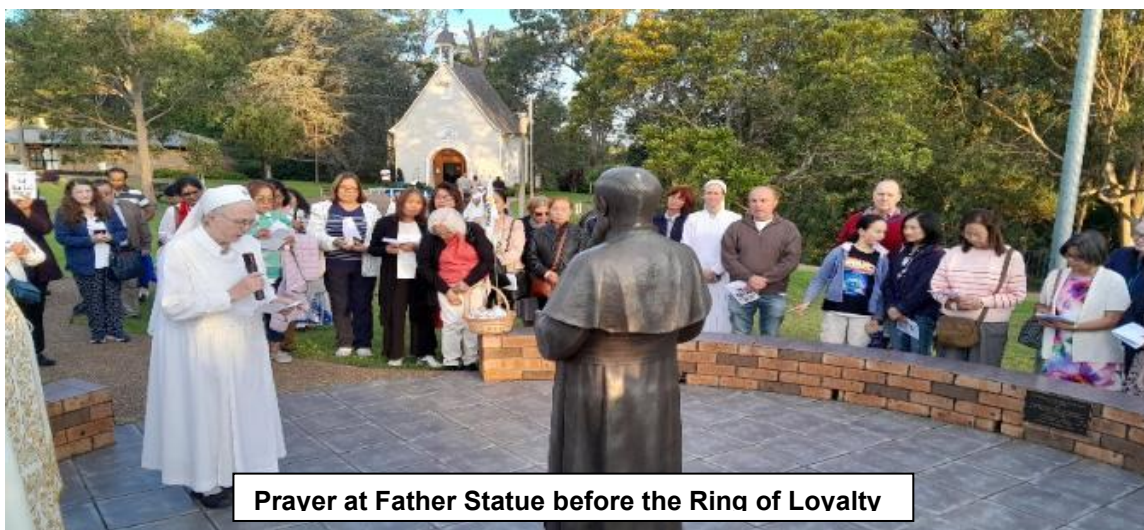
Prayer at Father Statue before the Ring of Loyalty