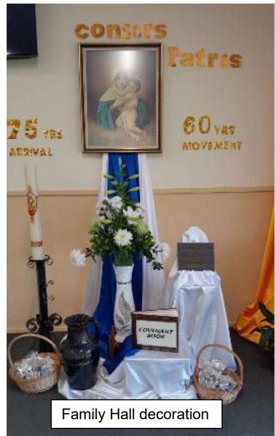
Family Hall decoration